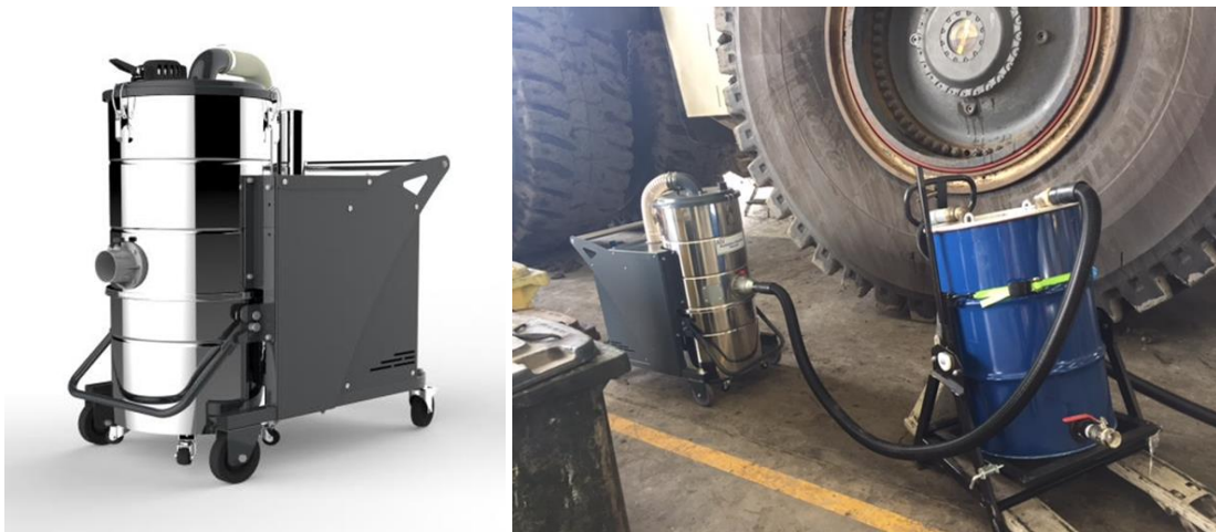
Dashclean A827 industrial vacuum unit with additional dust collector

A shopfloor fitter sourced an industrial vacuum cleaner and requested permission to trial the effectiveness of the unit in removing the compacted and often moist dust, with the aim of eliminating the use of high pressure air for blowing out the collectors and cabinets. An additional dust collection drum was also fitted to the unit to provide extra capacity and ease of emptying.