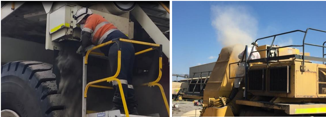
Previous methods of cleaning out air boxes and cabinets

Maintenance activities on large mining equipment can present an increased exposure to respirable dust. The previously accepted practises of blowing out or scraping dust out of collectors or cabinets was identified through the hazard reporting process as presenting an unacceptable level of risk, due to the dust becoming airborne and creating a significant health risk to personnel undertaking these critical maintenance activities. An improvement project was initiated from the shopfloor to identify ways to limit the worker's exposure to the respirable dust hazards.