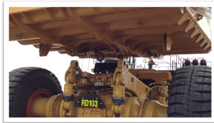
Figure 1: Suspended 797F OHT Body

A risk assessment identified the potential risks to workers installing and removing the body pins, including crush injuries, falls and ergonomic hazards.