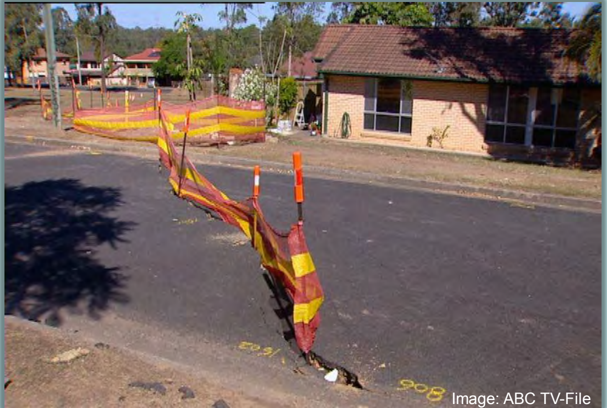
Collingwood Park State Guarantee Chapter 12, Mineral Resources Act 1989