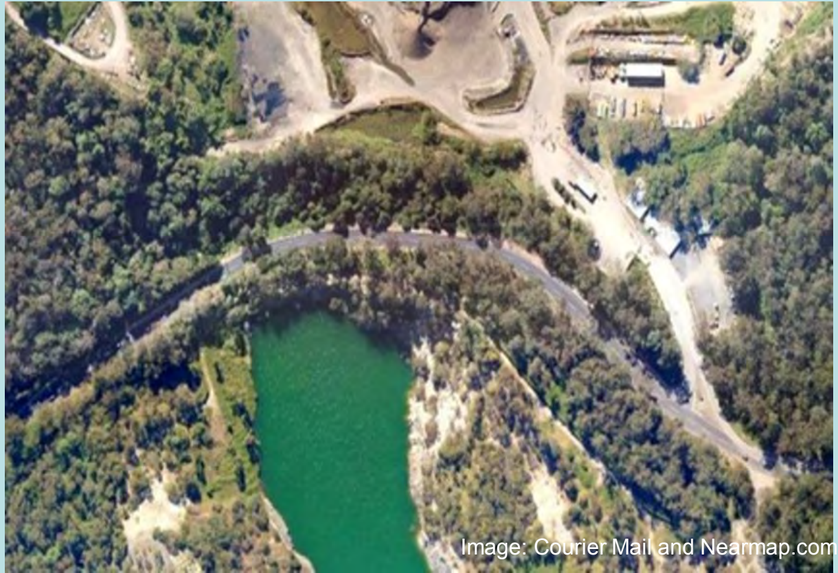
Disused quarry at Mount Gravatt East