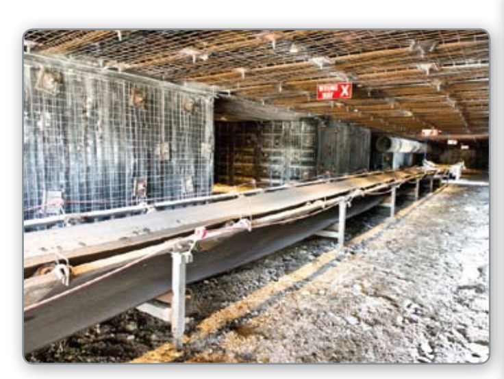
Working belt and roadway in Myne Start training complex

To date the mine site hosts have recognised the effectiveness of the training within Myne Start, reducing the required cleanskin training period on site by the training time within the facility and/or reducing the ratio of experienced to inexperience personnel working underground, with large mining companies including BMA and Anglo American working with Myne Start to deliver the program to their own newly employed permanent inexperienced workforce. General feedback from mine sites has been extremely positive, clearly indicating that the employees who have completed the program are far more advanced in not only their safety awareness but in the industry knowledge and skills required to effectively commence operation in the underground environment, when compared other inexperienced employees that have gone direct to site.