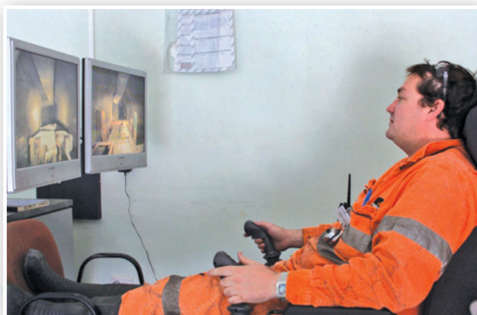
Figure 2: Cannington worker using system.