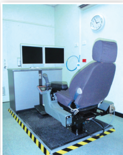
Figure 1: Surface Teleremote control system

At the point of development and implementation, this system was unique to Cannington and not utilised anywhere else in the world. The Surface Teleremote Operation is a custom designed system and a leading example of best practice remote technology in the industry.