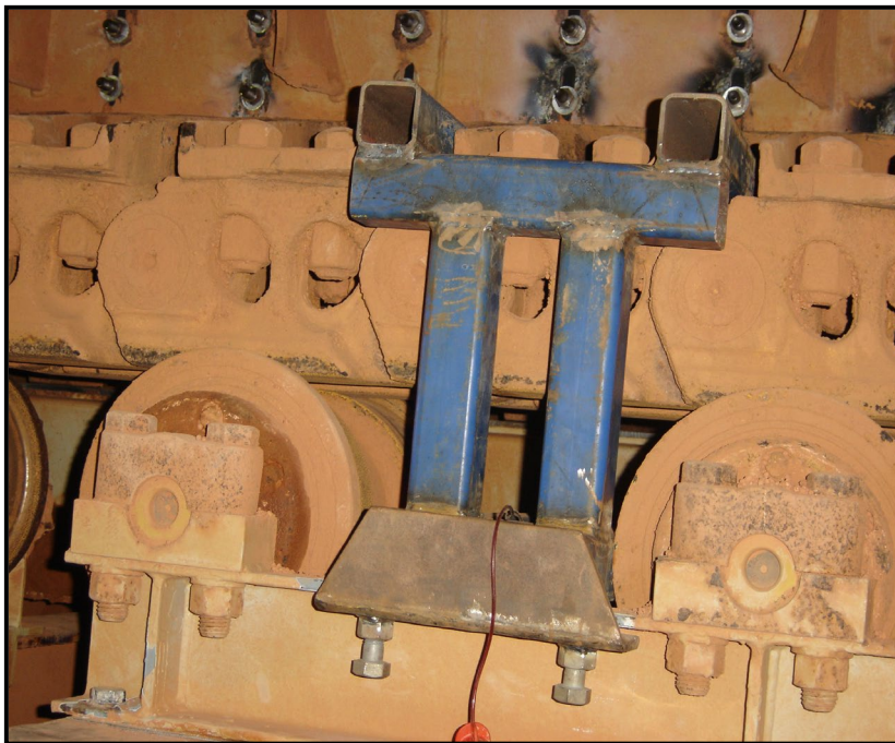
Figure 1: The locking tool attached to the apron feeder assembly.

The tool is bolted to the apron feeder stringers while engaging the flytes. This prevents any movement of the apron feeder chain due to gravitational forces. Once the tool is locked into position it becomes part of the lockout procedure.