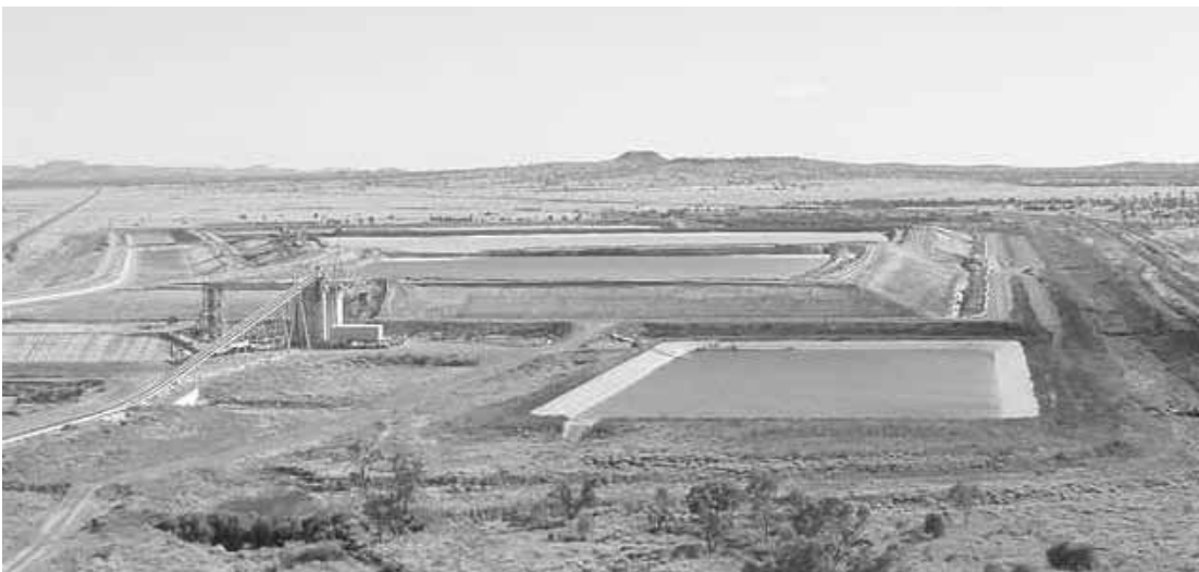
The Gypsum stack (as photographed from the Granulation Plant)