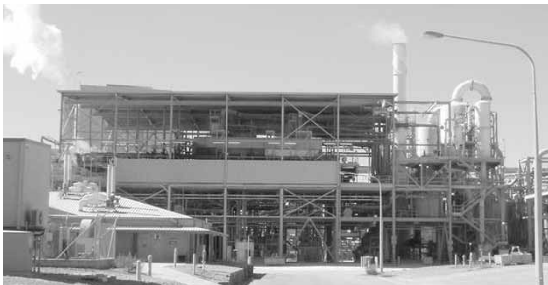
The Phosphoric Acid Plant at Phosphate Hill

The baseline health survey was carried out across all three QFO sites between April and May 2002. The work was completed by Southwest Occupational Health