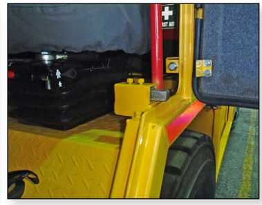
Winner 2017 SAFE STOP (Anti Door Jam Unit) Redpath Australia Pty Limited