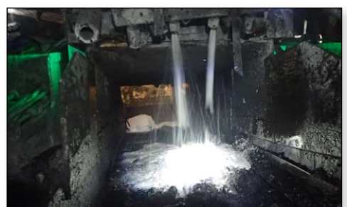
Winner 2018 Grasstree Development Team Dust Suppression Anglo American - Grasstree Mine

Submissions will be included on the Conference Handbook and Website, at the discretion of the Conference Committee.