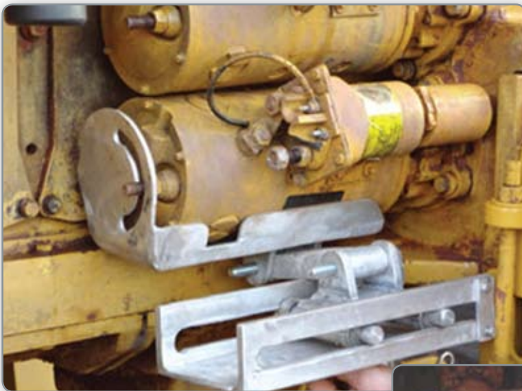
Figure 1: Starter motor jig being bolted into place

Our site management of change processes was completed with approval and sign off by management and the innovation was implemented and shared with other departments on site.