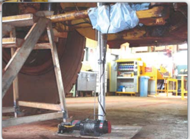
Figure 2: Jig extended into place